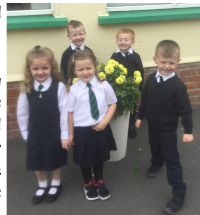
Our P1s on their first day of school.

I am honoured to have been Acting Principal given this opportunity to