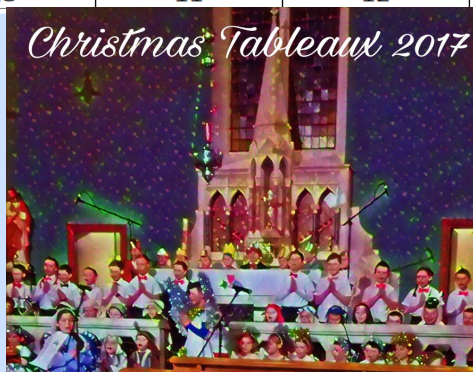
Christmas Tableaux 2017

Please note the school will be closed for children from Friday 9th- Friday 16th February. All children will return to school on Monday 19th February 2018.